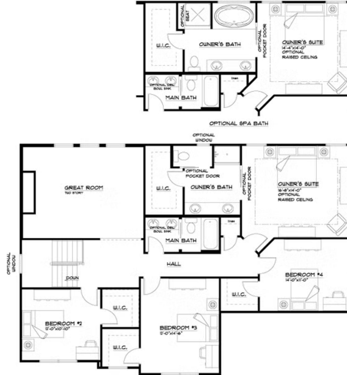
SECOND FLOOR PLAN THE "CAMBRIDGE 22A" 7/12/2022 LIVING AREA: 1332 S.F. CLERESTORY: 274 S.F. TOTAL AREA: 1606 S.F.