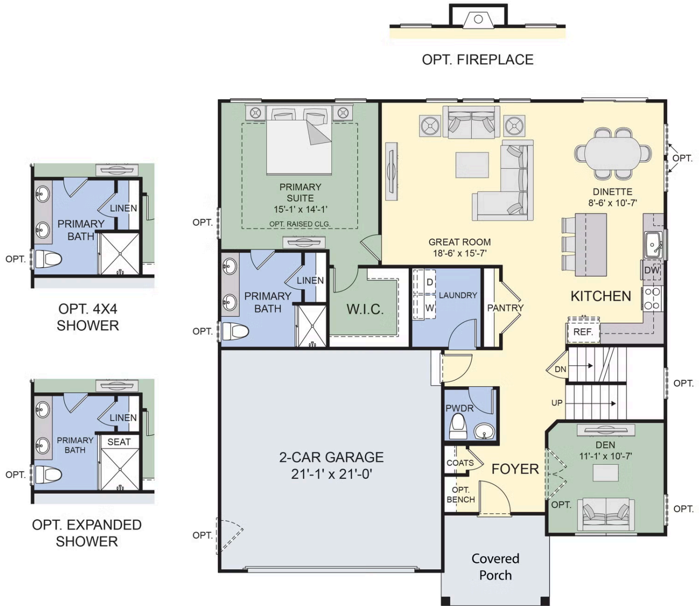
Cavanaugh 23A, 4/2024 MAIN FLOOR