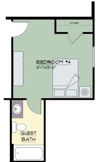
OPTIONAL GUEST BATH ADD 41 S.F.