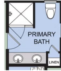
OPT. ENLARGED SHOWER