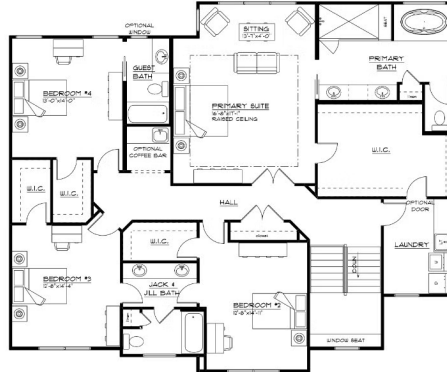
SECOND FLOOR PLAN THE "LEXINGTON 204" Thursday, March 25, 2010 LIVING AREA: 2026 S.F.