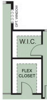
OPTIONAL FLEX CLOSET