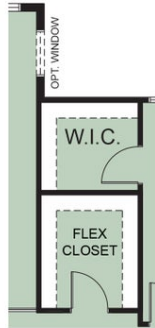
OPTIONAL FLEX CLOSET