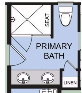
OPT. ENLARGED SHOWER W/ SEAT