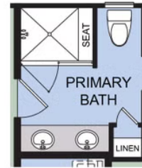
OPT. ENLARGED SHOWER W/ SEAT