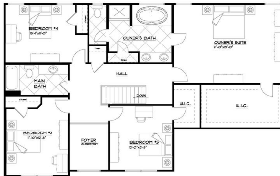
SECOND FLOOR PLAN THE HENNEFIELD 184' 6/3/2021 LIVING AREA: 1519 S.F. CLERSITORY: 646 S.F. TOTAL AREA: 1865 S.F.